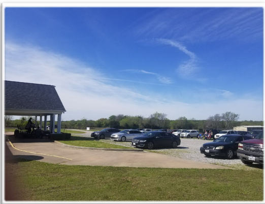
Left and Right: Sherman's drive in service Sunday: